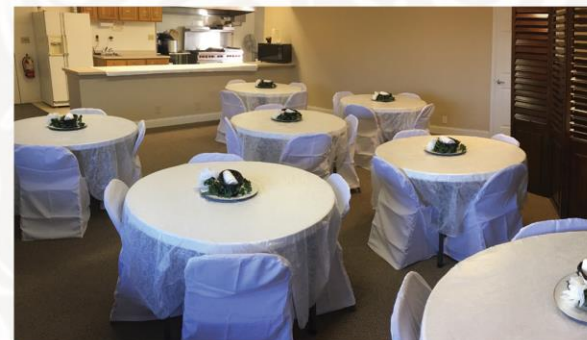
Welcome Center Event Space